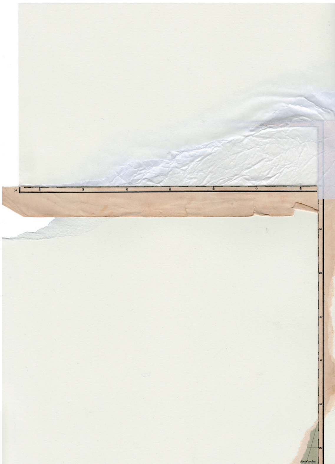
Sophie Dvořák Untitled Collage / Mixed media, 30 x 22 cm © 2017