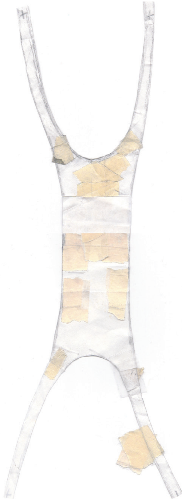
Delphine Pouillé Agility Pattern (original) Paper and adhesive tape, 35 x 13 cm © 2016